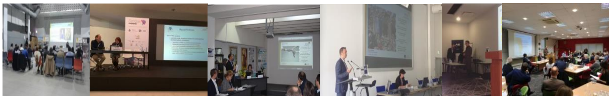
RESET-Thematic Seminars: Alcoy(ES); Porto(PT); Bucharest(RO); Chemnitz(DE); Lodz(PL); Huddersfield(UK)